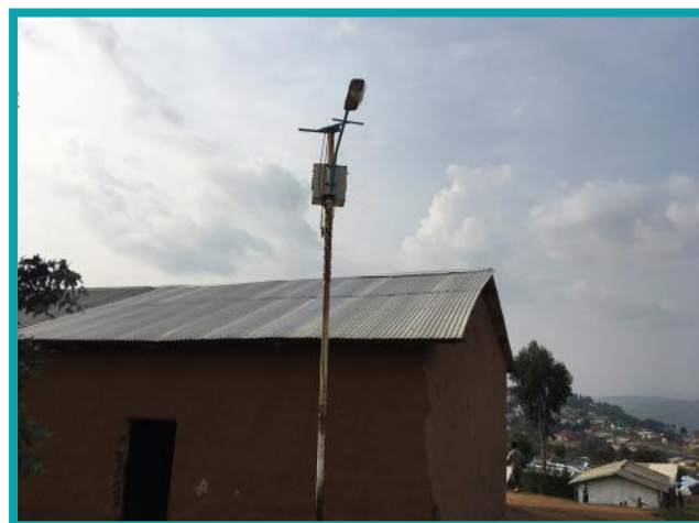
Photo: Solar street light in disrepair at Gihembe Refugee Camp, Rwanda.

In many cases in Sub-Saharan Africa, refugees come from situations where the energy access level was similar or even lower than the one found in camps. It is therefore not inaccurate to say that the overall energy access problem for refugees often resembles the energy access problems suffered by the host community.