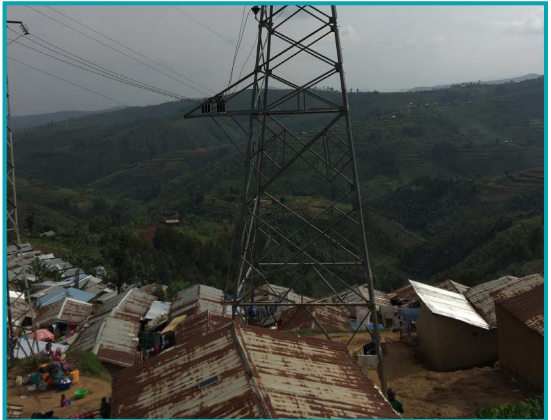
Kigeme Refugee Camp, Rwanda