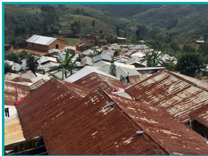
Photo: Small scale solar panels at Nyabiheke refugee camp, Rwanda.

The energy-access literature places great importance on 'productive-use' – i.e. how new energy sources can and are used for hitherto inaccessible productive purposes (Poor People's Energy Outlook, 2012; PRODUSE, 2011). Theoretically, lacking the freedom to work means that it should be difficult for refugees to use new supplies of energy productively, for example by setting up businesses which make use of improved electricity supply. But in practice we have found that the main barriers to refugees' establishing enterprises in humanitarian settings are not legal but financial – a finding backed up by studies in other countries not specifically focused on energy (Zetter and Ruaudel, 2016). In Goudoubo refugee camp, key enterprises include rearing livestock, leatherwork, food stalls, restaurants and retail shops. The camp also has a mechanic, a tailor and two blacksmiths, but these camp entrepreneurs are limited to using hand tools (Corbyn and Vianello, 2018).