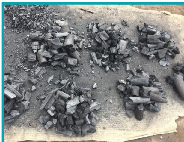
Photos: Charcoal and firewood fuel sources at Nyabiheke (left) and Kigeme (right) refugee camps, Rwanda.